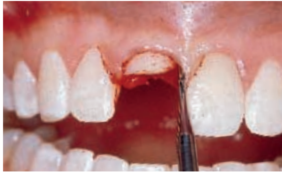
Figure 10 —Atraumatic extraction technique using Periotome instrumentation into the periodontal ligament space.