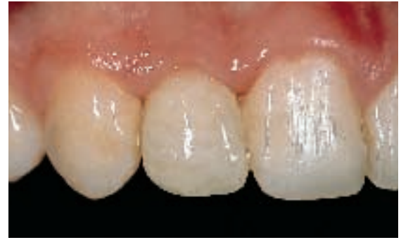
Figure 16 —An all-ceramic crown on an aurabase custom abutment is permanently inserted at 7 weeks.

The stability of the implant is mechanically optimized in the early phase by using a screw-type implant of maximum length and decreasing apical taper (Figures 12 and 13). Early biological stability is greatly enhanced by the promotion of bone apposition and increased contact using a roughened titanium surface to the implant. The elimination of the need for membrane technology and guided bone regeneration at the time of surgery, as required around stan-