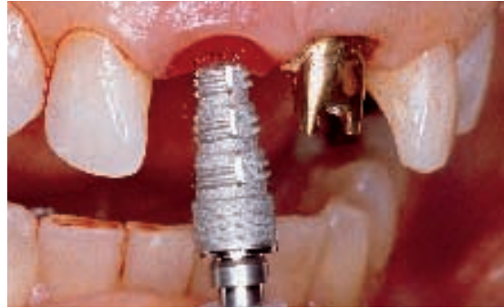
Figure 4 —A stepped-tapered FRIALIT®-2 implant is inserted after coring out the resorping root in an incisionless mode.

ondary biologic stabilization, and the early percentage of bone-to-titanium contact. The original machined surface may be grit-blasted, acid-etched, or titanium-plasma-sprayed to achieve this roughened state as well as to increase the relative surface area. These microgeometric changes in the implant surface appear to result in an increased early bone-to-implant contact with resultant increased stability and decreased potential for a fibrous connective-tissue interface around the implant.