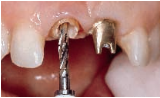
Figure 1 —A 2-mm twist drill is inserted into the root canal after the gutta percha and extends through the apex into native bone.