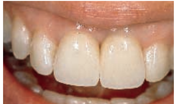
Figure 8 —The finished all-ceramic restorations on metal abutments showing preservation of the soft-tissue form and completed at 8 weeks.

The nonsalvageable tooth is first cut off horizontally, level with the free gingival margin providing access to the underlying root canal. A 2-mm twist drill is inserted into the root canal, progressively removing the gutta percha entirely before extending through the apex into the surrounding native bone (Figure 1). This step is followed by a 3-mm twist drill, which is used to circumferentially remove more of the internal structure of the root. At this stage, changing to a tapering form of drill is crucial to protect the bone and a stepped-tapered drill that decreases in diameter apically is inserted into the root face (Figure 2). Depending on the size of the tooth, this may range in diameter from a 4.5-mm drill through to a 5.5-mm twist or even a 6.5-mm drill.