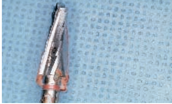
Figure 12 —A step-tapered dedicated drill approximately 5.5 mm in diameter at the neck was then used to prepare the osteotomy for immediate implant placement. The design of the drill very closely resembles the shape and taper of the natural tooth.

the prepared site greatly enhances the potential success of this technique.