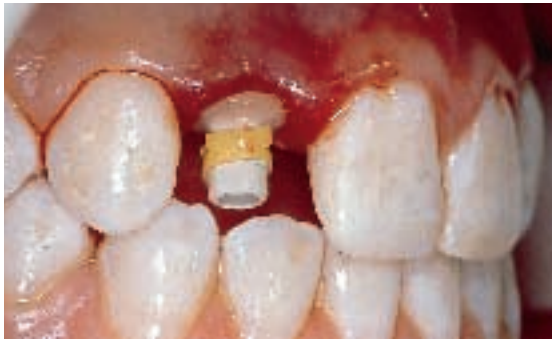
Figure 15 —The lateral incisor is extracted using a Periotome. The implant is immediately inserted without raising a flap, and the temporary cylinder is positioned with composite placed in the soft-tissue socket to preserve the restorative gingival interface contour.