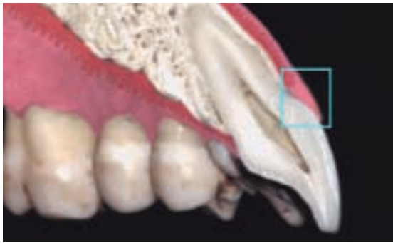
Figure 5 —Computer-generated image of the extraction site showing the critical unsupported tissues of the restorative gingival interface.