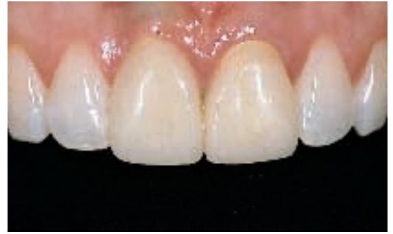
Figure 14 —Immediate total replacement of tooth No. 8 with temporization in place at 1 week postoperative. This temporary restoration is nonfunctional and is purely used as an immediate esthetic replacement for the patient while maintaining the subgingival profile for the eventual final restoration.

implant face. Packable composite is introduced into the remainder of the surrounding soft-tissue socket to support the papillae laterally and the free gingival margin facially (Figure 6). When the soft-tissue form is once again identical to the original form, the composite material is light-cured. This step develops and then stabilizes the submergence profile for the “immediate total tooth replacement” technique.