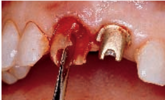
Figure 3 —The remaining root fragment is removed using a Periostome to sever the periodontal ligament fibers by collapsing the root periphery inwards and lifting it out coronally.