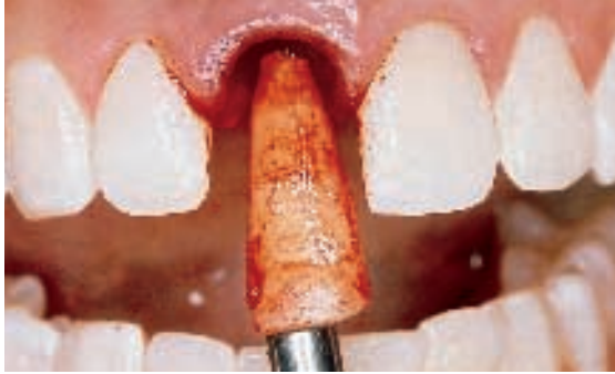
Figure 11 —After full circumferential application of the Periotome, complete atraumatic extraction of the subosseous portion of the tooth root was successfully completed without any damage to the adjacent hard and soft tissues.