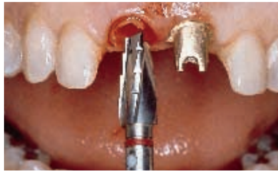
Figure 2 —A stepped-tapered FRIALIT®-2 drill is used to remove the remaining root structure of the tapered root without compromising the bone.