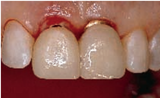
Figure 7 —The emergence profile is restored as the temporary crown of the tooth is joined to the submergence profile on the temporary cylinder.