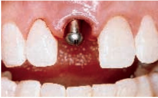
Figure 13 —The implant carrier (showing through the extraction access) after immediate placement of a 5.5- X 13-mm stepped screw-type implant. When attempting to accomplish immediate total replacement procedures that involve immediate temporization, a threaded design is suggested rather than purely press fit.